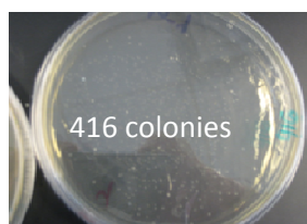
Plain yogurt plate 10^{-4}

The subsequent test involved several dilutions of each yogurt sample to find more accurate results. Dilutions were conducted by obtaining 0.1 g of the food sample - and adding to that sample – 1000 µl of PBS buffer solution. From this mixture, 100 µl were plated onto a sterilized petri dish, with Trypticase soy agar already on the bottom as a growing medium. Petri dishes of each food sample were created at ten-fold dilutions ( 10^{-6} , 10^{-5} , 10^{-4} , ...). These petri dishes were placed in an incubator at 37°C for two days. At the end of the two days, the petri dishes were observed for bacterial growth of colonies. The results provided the amount of colonies that were present on the petri dishes of each food sample and its diluted plates. The only plates that were used in the data collection were plates 10^{-6} , 10^{-5} , and 10^{-4} , as they were the only plates with a countable number of colonies (shown below).