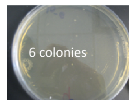
Plain yogurt plate 10^{-6}