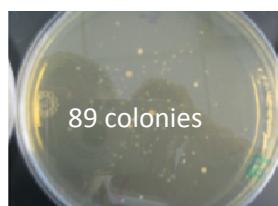
Plain yogurt plate 10^{-5}